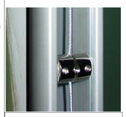
Support stud: double-sided display